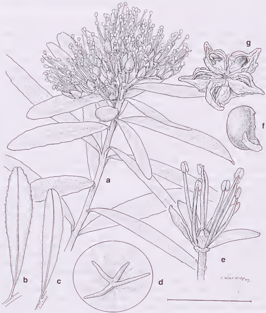
Fig. 1. Leonema scopulinum a, flowering branchlet (S. Clarke s.n., NSW 613314); b, juvenile leaf (S. Clarke s.n., NSW 613313); c, mature adult leaf (D. Crayn 595 et al.); d, stellate hair (D. Crayn 595 et al.); e, flower (D. Crayn 595 et al.); f, seed (D. Crayn 778 et al.); g, fruit including seeds (D. Crayn 778 et al.). Scale bar a = 3.75 cm, b, c = 4 cm, d = 275 \mu m, e = 1.2 cm, f = 0.5 cm, g = 1 cm.